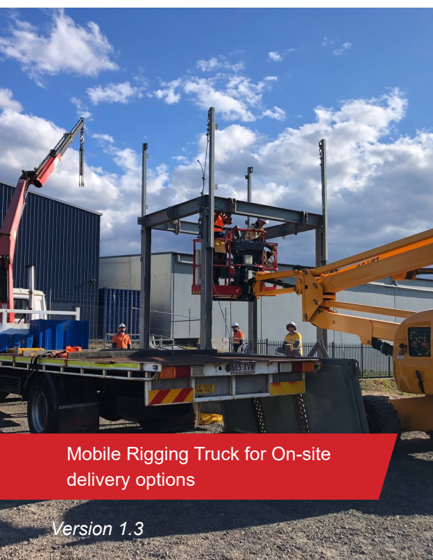
Mobile Rigging Truck for On-site delivery options

SWQ also owns and trains with a mobile rigging truck with vehicle loading crane to ensure compliance with all aspects of training and assessment for the Basic Rigging High-Risk Work Licence course.