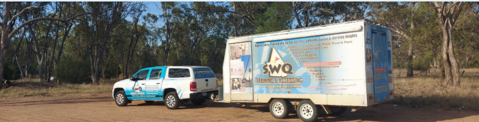
Mobile Safety Unit for on-site delivery options